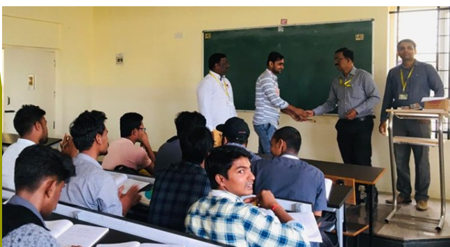
Technical Quiz prize distribution