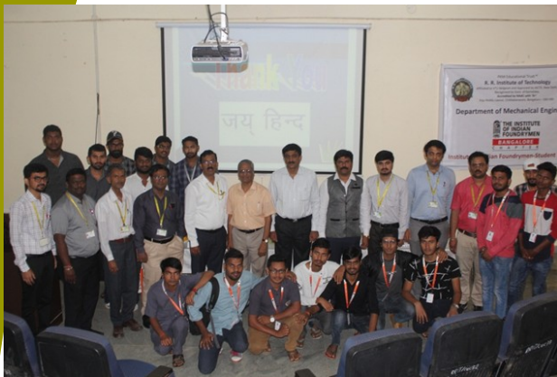
Participants with dignitaries and faculties in the event