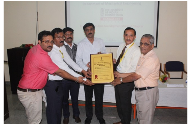
IIF student chapter certificate presented to ME department